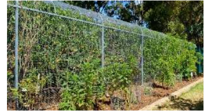
Midway Park, Roslyn Park