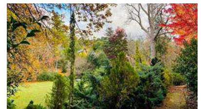
Stangate House, Aldgate