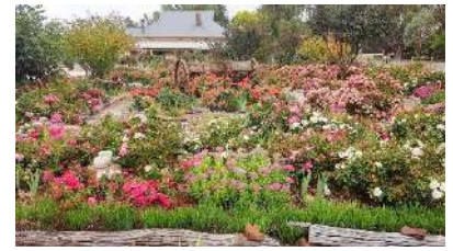
Frosty Flats, Birdwood