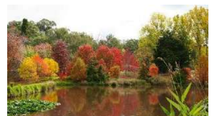
Cooinda, Mt George