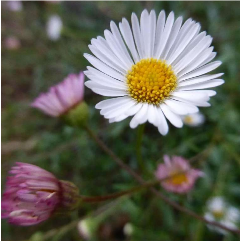
Erigeron. Erigeron is a large genus of plants in the family Asteraceae.

Open Gardens South Australia is a not for profit organisation opening private gardens to the general public. The purpose of Open Gardens SA is to educate and promote the enjoyment, knowledge and benefits of gardens and gardening in South Australia and to build strong public support for the development of gardens.