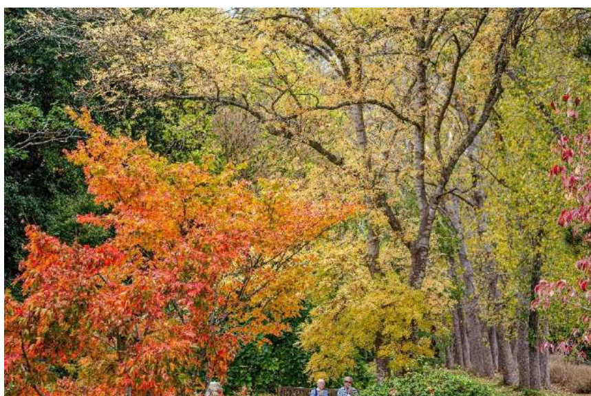
Stunning Autumn Colours at Coinda – Mt George.

Open Gardens SA is delighted with the result of our inaugural Harvest Garden Festival – a great result with visitors enjoying fabulous productive gardens over two days in February and as a result $30,000 was donated to OzHarvest. It's always a pleasure to be able to open such interesting and inspiring gardens for our visitors. And we have another special event in April – the SA Landscape Festival is on the weekend of the 15 and 16 April 2023 – don't miss it! We also have our regular program of open gardens for you to visit. We hope to see you at an open garden this Autumn!