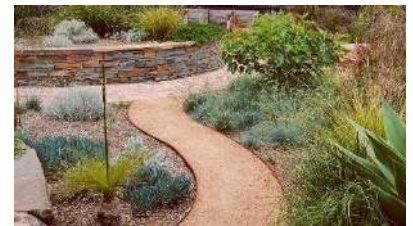
Lucy's Garden, Port Willunga