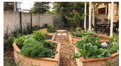
Henley Beach Gardens, Coast Haven