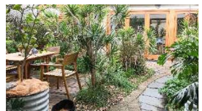
Henley Beach Gardens, Henley On Sea