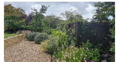
Videon Wells Garden. Springfield