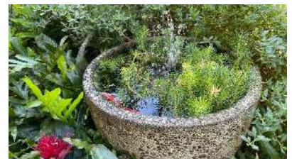
Henley Beach Gardens, Grevilleville