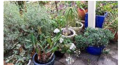
Henley Beach Gardens, Chester Street