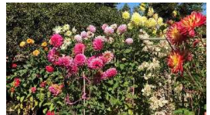
Henley Beach Gardens, Cottage Corner