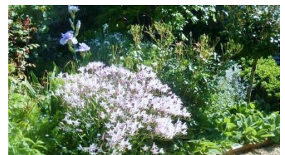
Watson Garden, Mount Gambier