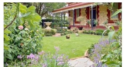
Churston, West Croydon