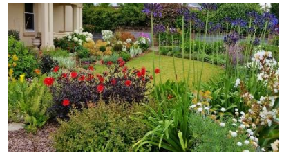
Jane's Garden, Mount Gambier