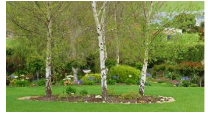
Jennings Garden, Mount Gambier

Semmens' Interesting Garden , 33 Torrens Street, Torrensville