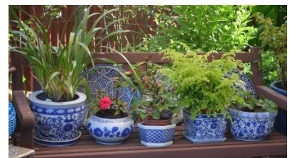
Anna's Garden, Clarence Gardens