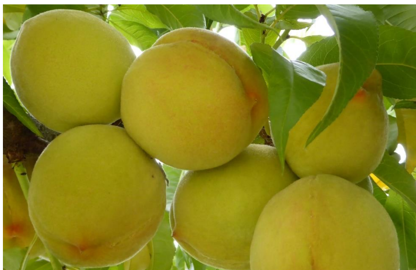
Summer Peaches ripening on the tree.

Summer has arrived and Christmas is just around the corner! The “lazy days of summer” provide a tantalising image of rest and relaxation, so we hope you have time to enjoy the season without too much stress from holiday preparations. Tis the season of giving and sharing and this edition features three stories highlighting how OGSA and our garden owners support charities and the community. Enjoy the summer season with all it has to offer....and from OGSA, we wish you and your family and friends a very happy and safe Christmas.