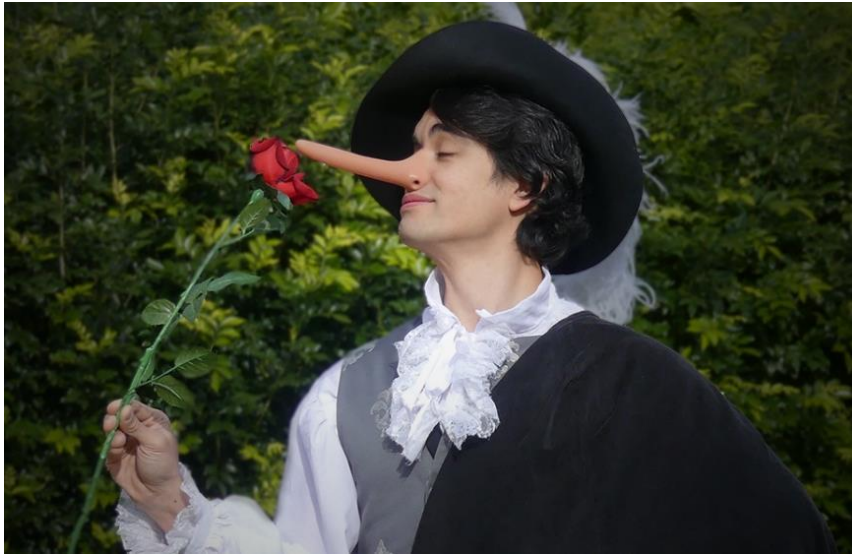
A heart as big as his nose!

Five cross-dressing nuns will re-tell one of literature's greatest love stories in a cheeky version of Cyrano de Bergerac set in four beautiful gardens this summer.