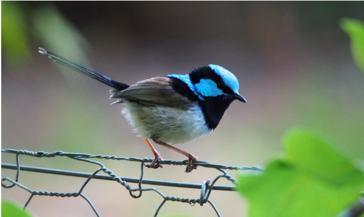
Male Superb Fairy Wren, Scientific Name: Malurus cyaneus

Open Gardens South Australia is a not for profit organisation opening private gardens to the general public.